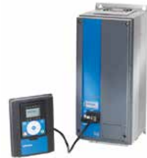
Keypad door mounting kit